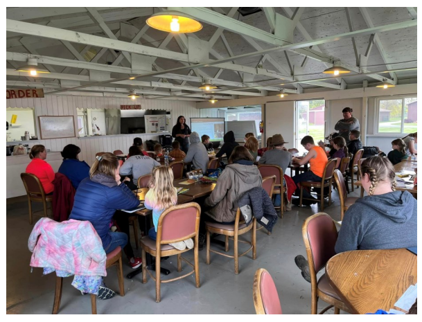
4-H Youth Swine Day held in partnership with the Gratiot County Fair for Youth.