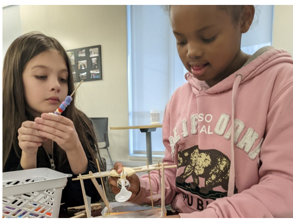
4-H offers youth the opportunity to pick an animal or still-life project and learn throughout the year. The culmination is often the show at the County Fair.

The MSU Extension Children and Youth Institute provides programs for youth, caregivers, and families.