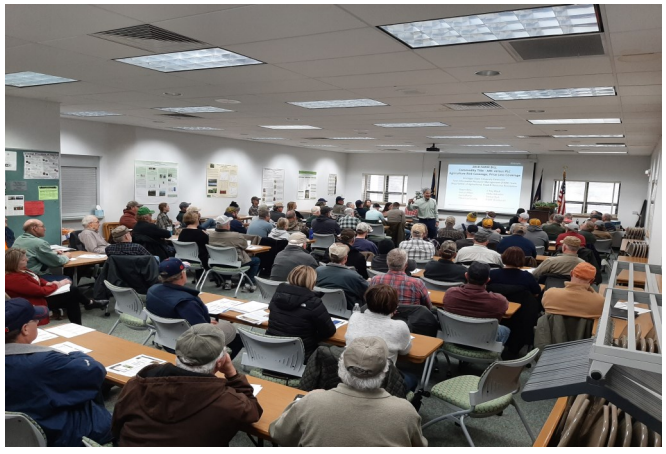
Farm Business Educators explain the Farm bill.